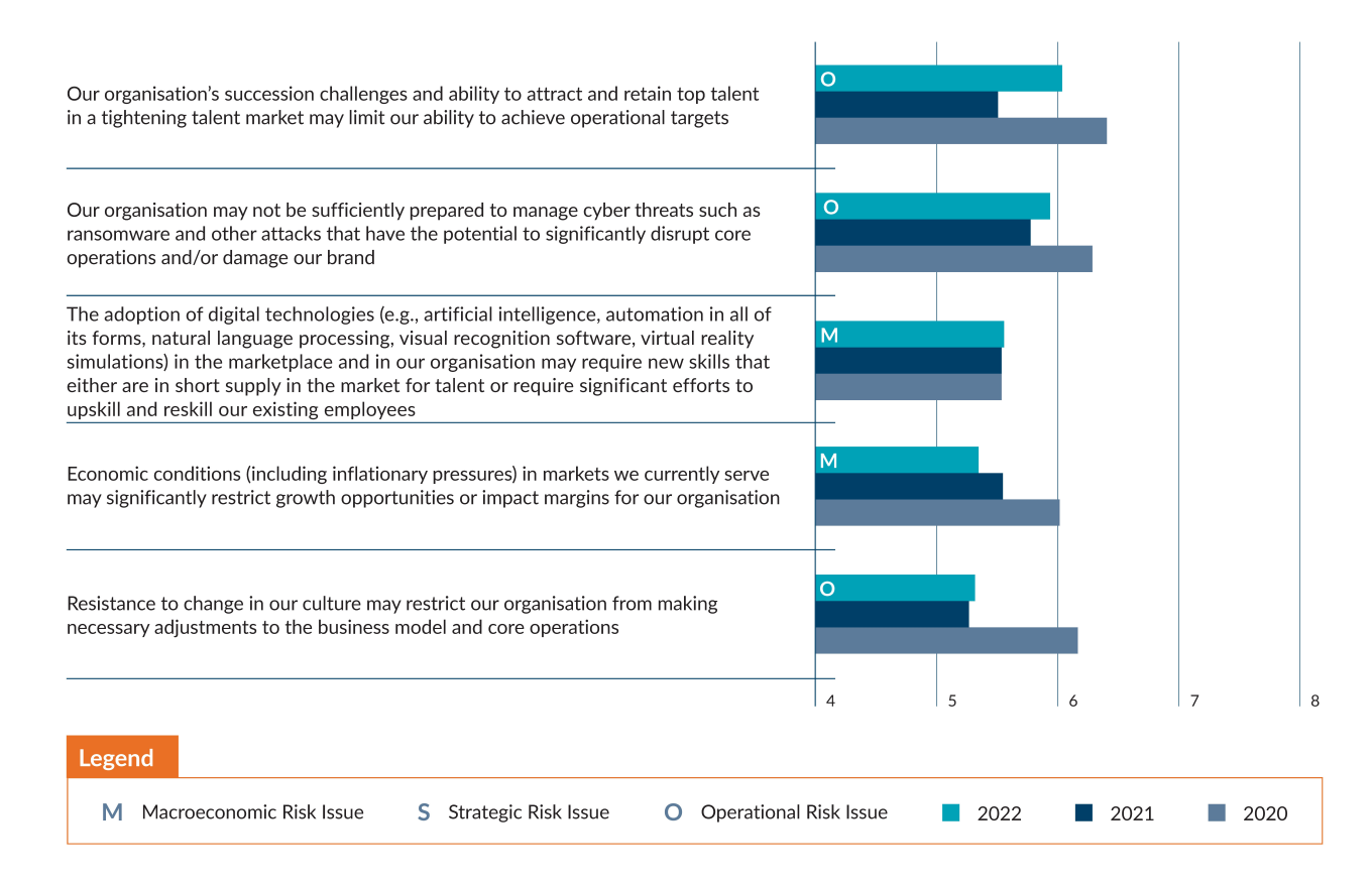
CAEs - 2022

agility is evident in the way that the risk ratings CAEs ascribe to various risks fluctuate from year to year. Compared to our 2021 survey response, CAEs this year rate succession challenges, cyber threats and the organisation's adoption of AI and other advanced digital technologies as higher concerns. That ability to pivot in a risk-intelligent way represents a core competency of a next-generation internal audit capability.